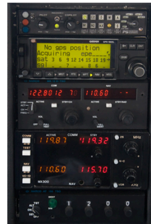
• GNC 150XL: GPS (VFR), No Comm • Narco MK 12D: Comm/Nav 1 • TKM MX-300: Comm/Nav 2