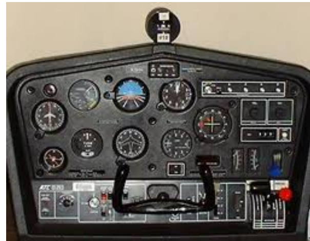
COMPARISON OF FEATURES ATC-510 & ATC-610

In addition to the unit, the original operations manual is also available and it can be found on the club's website. go to www.flymafc.com and click on OTHER PAGES (top right) then select DOCUMENTS. Once that page opens you will find the manual under AVIATION MANUALS.