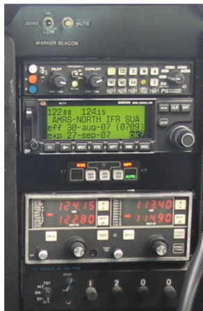
• GNC 300XL: GPS (IFR) + Comm • KX 170B: Comm/Nav