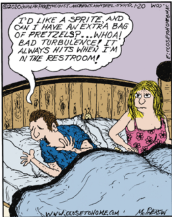
Bert has another one of his flying dreams.