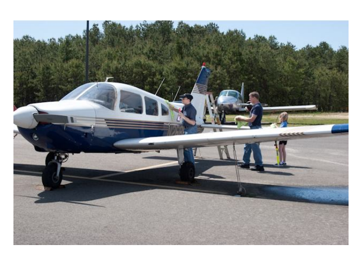
MAFC 2010 Spring Plane Wash