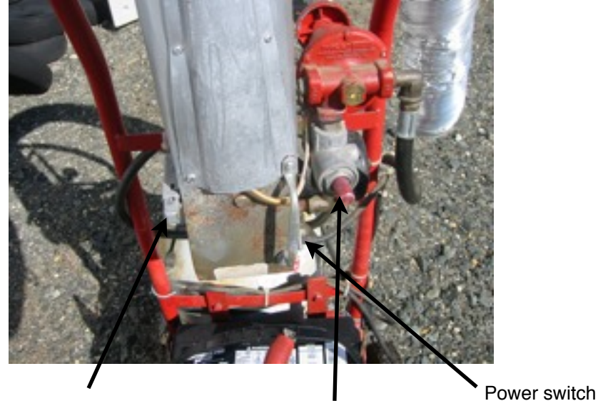
Press the igniter (left) and the fuel supply button (right)