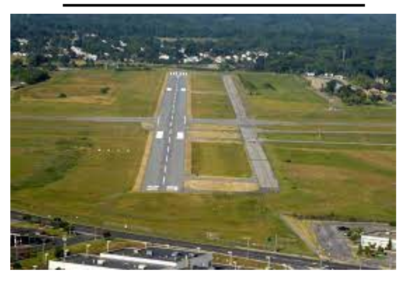
KXLL Queen City Airport, PA