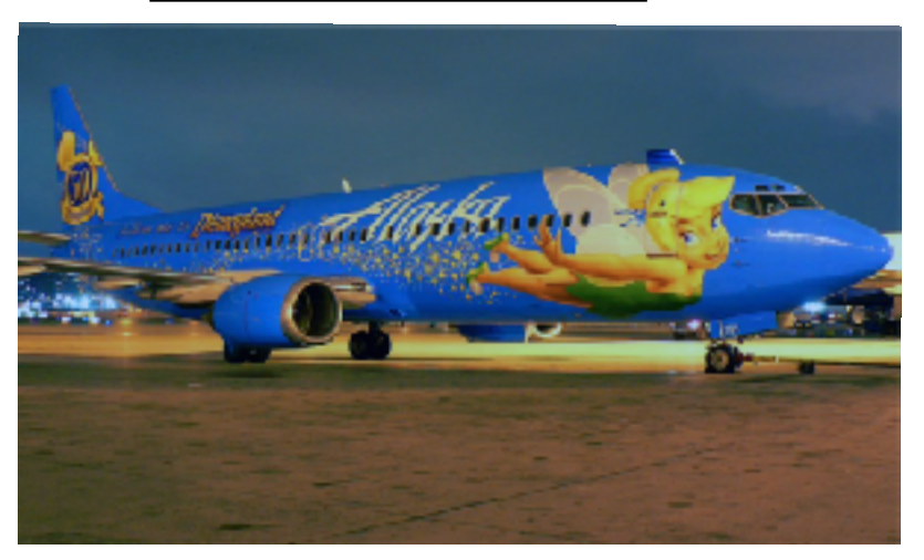
Takeoffs are optional but landings are mandatory