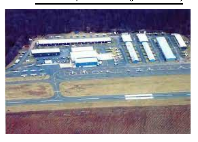
39N Princeton Airport