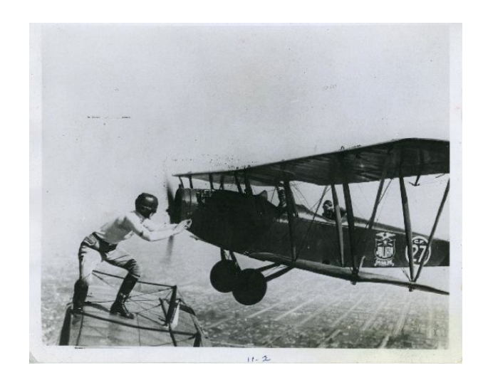
Gladys Ingle leaping from one aircraft to another

The 13 Black Cats were famous stunt and movie flyers. They appeared in Howard Hughes', "Hells Angels" and in other 1920s films. The group contracted with MGM to use Aero Corp.'s planes in the movies.