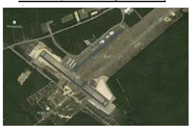
KMJX Ocean County Airport