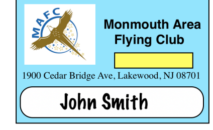
Elected or Appointed Leader