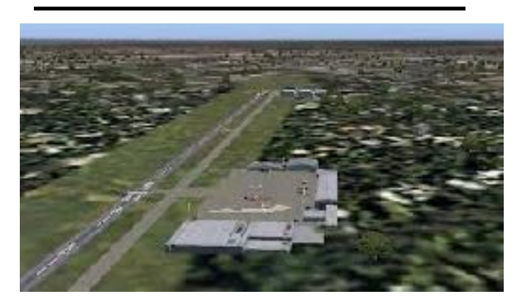
Camden County 19N