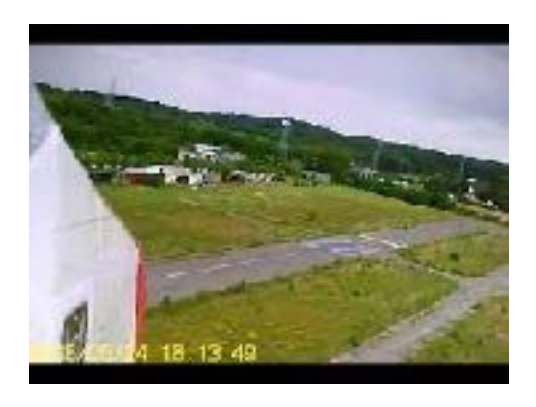
Marlboro Airport 2N8 (CLOSED)

From KBLM we moved briefly to the basement of an office building on the corner of Route 34 and Belmar Boulevard. So there was a time when our "clubhouse" was actually located in an office building about a half-mile north of the airport.