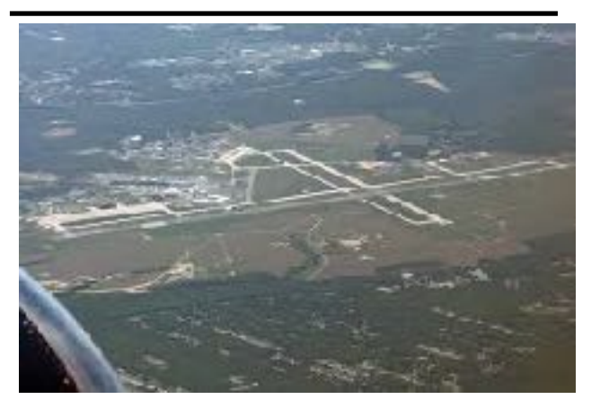
Atlantic City Airport (KACY)