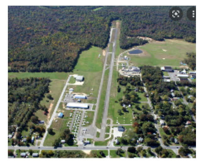
Takeoffs are optional but landings are mandatory Cross Keys 17N