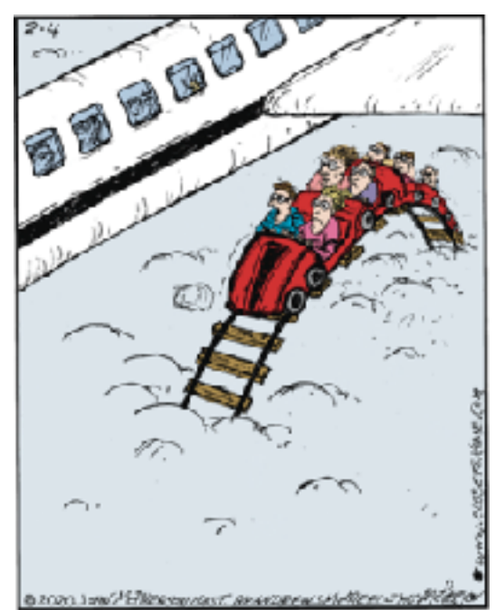
"How about NOW?! NOW do you believe that this is the TALLEST roller coaster in the world?!"