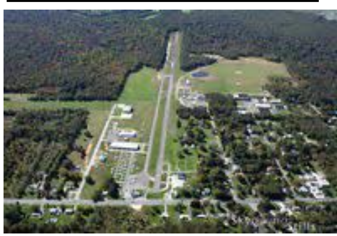
Cross Keys 17N